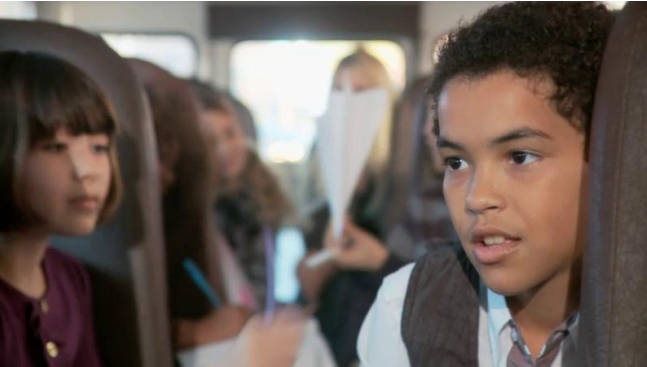
1 Going to school

3 Watch the video again. Write what happens in the pictures.